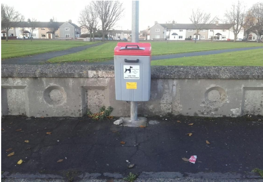
New style Dog Fouling Bin installed at the green space in Tolka Estate