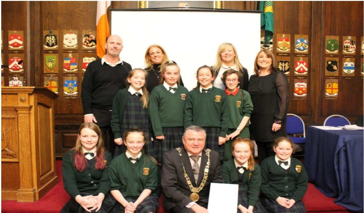
Pupils and staff from St. Brigid's GNS, Glasnevin, winners of the overall prize in the City Neighbourhoods Schools Competition 2016, pictured with the Lord Mayor and members of the Public Domain Team