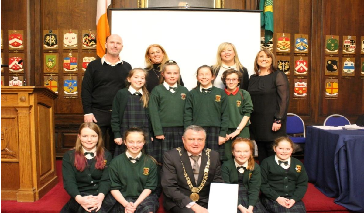
Pupils and staff from St. Brigid's GNS, Glasnevin, winners of the overall prize in the City Neighbourhoods Schools Competition 2016, pictured with the Lord Mayor and members of the Public Domain Team