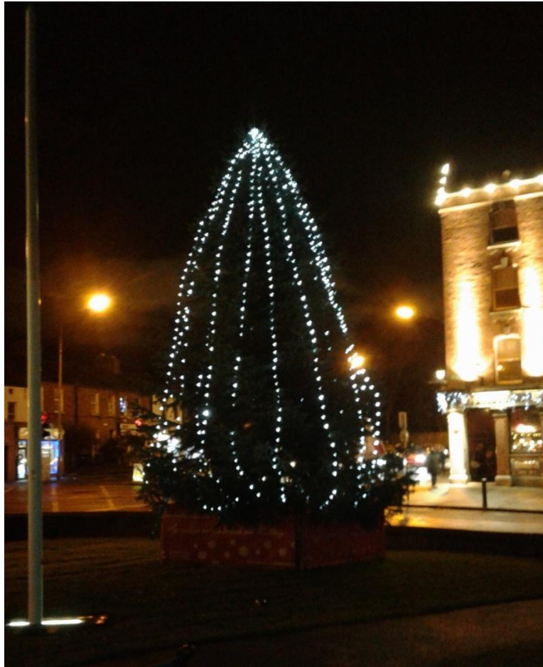
Drumcondra Village Christmas Tree 2016

Note: The facility will be closed on Saturday 24 th December and Monday 2 nd January. Collins Ave Bring Centre will be open on Sunday 8 th , 15 th & 22 nd January and Albert College Car Park and Mellows Park Depot will also be open Monday – Sunday during January to facilitate the recycling of Christmas Trees.