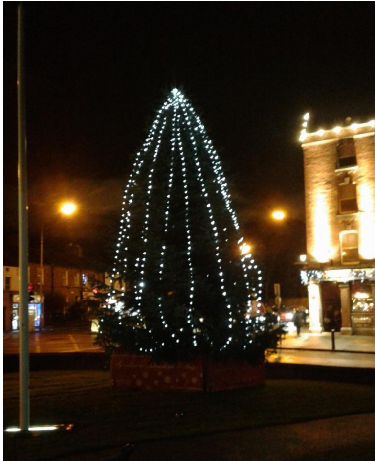
Drumcondra Village Christmas Tree 2016

Note: The facility will be closed on Saturday 24 th December and Monday 2 nd January. Collins Ave Bring Centre will be open on Sunday 8 th , 15 th & 22 nd January and Albert College Car Park and Mellows Park Depot will also be open Monday – Sunday during January to facilitate the recycling of Christmas Trees.